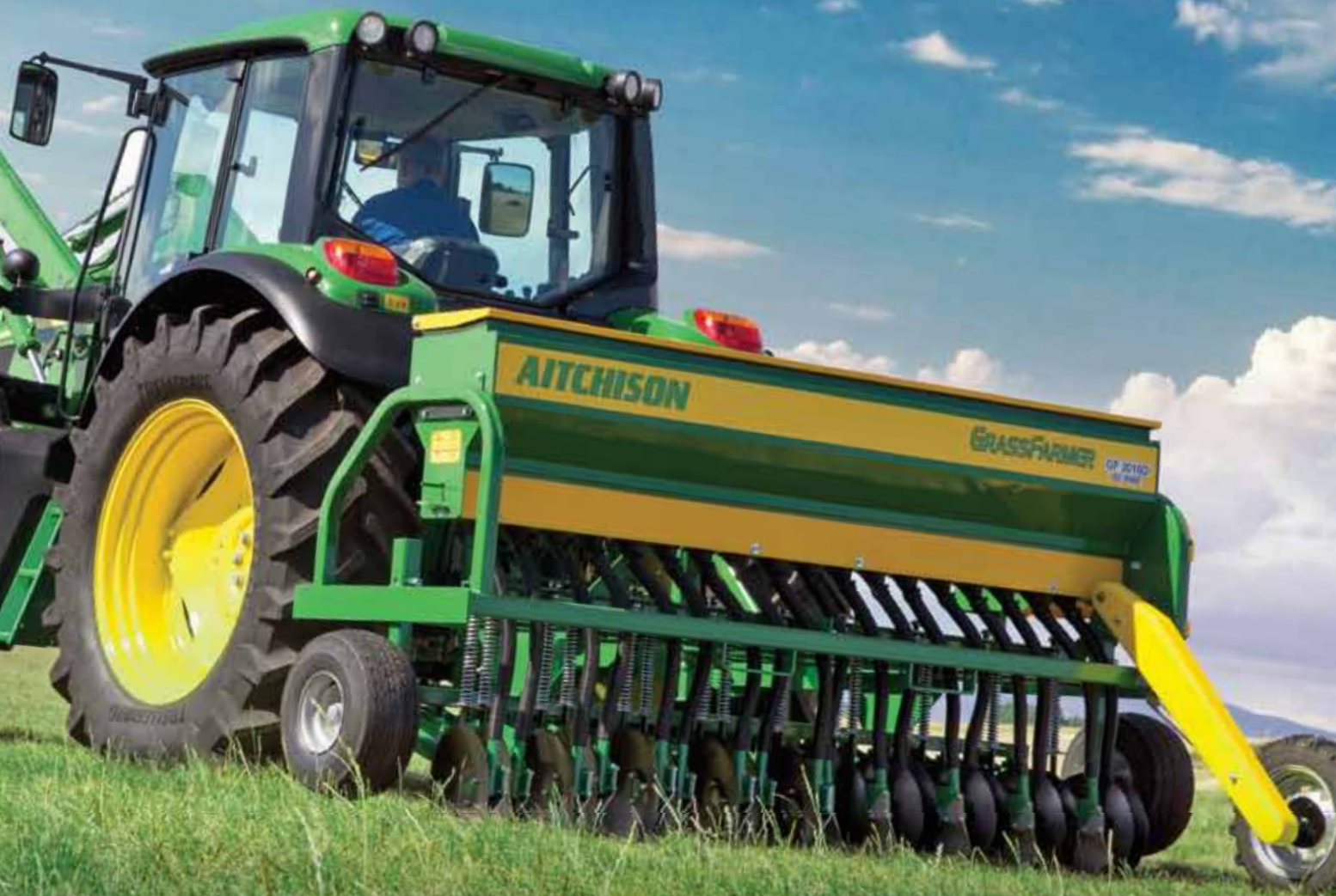
Disc version shown