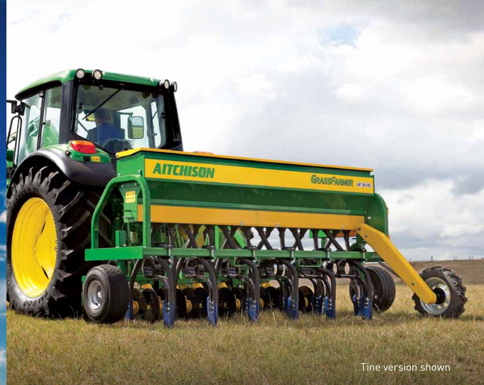
Tine version shown